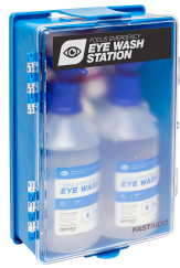
Dual-purpose wall mountable and portable plastic case