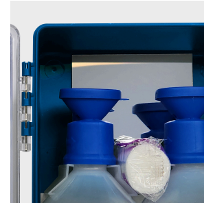
Internal mirror to assist with treatment of eye injuries