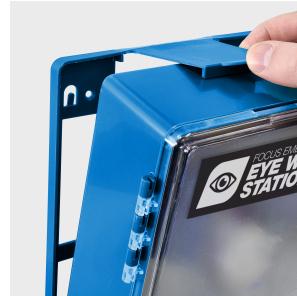
Dual-purpose wall mountable and portable plastic case