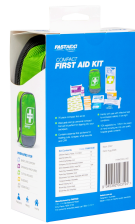
100% recyclable cardboard point of sale packaging with detailed product specifications