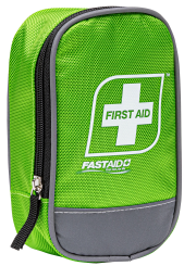
Portable grab and run soft pack case design