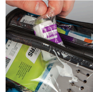
Unique fast and easy to locate colour coded first aid contents