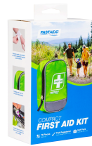
100% recyclable cardboard point of sale packaging with detailed product specifications